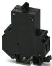
Thermomagnetic circuit breaker, 2-pos., normal blow, 1 N/O contact and 1 N/C contact, with universal foot for mounting on NS 32 or NS 35

Please be informed that the data shown in this PDF Document is generated from our Online Catalog. Please find the complete data in the user's documentation. Our General Terms of Use for Downloads are valid ( http://phoenixcontact.com/download )